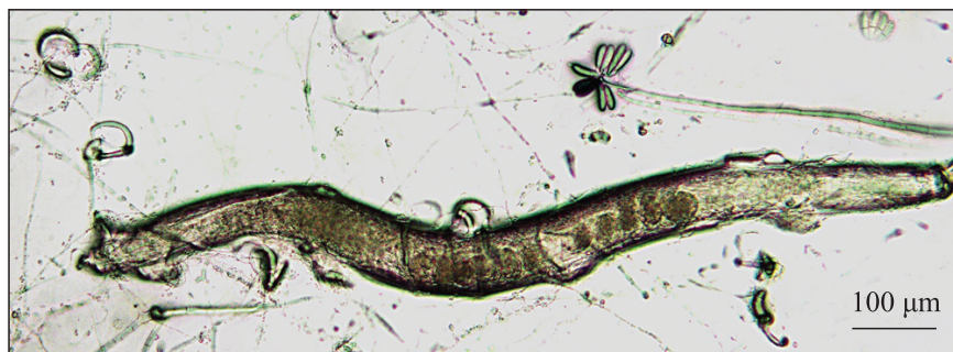
Fig. 1. A Rhabditis nematode in the adhesive hyphae of Arthrobotrys musiformis-911 on water agar). Bar: 100 \mu\text{m}

Out of two isolates of A. megalospora , one was highly active, causing the mortality of nematodes at the level of 90 % and one had poor activity (20 %).