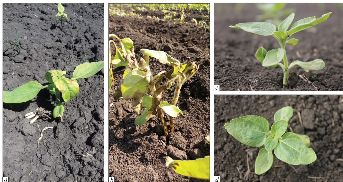
Fig. 3. Sunflower plant responses to herbicide Granstar Pro 75% w.g. a – end of the first week post-treatment; b – end of the second week, start of the third week post-treatment; c and d – genotype SURES 1, resistant to tribenuron methyl, on day 14 post-treatment

Note. *R – resistance, N – non-resistance of self-pollinated lines to the effect of a sulfonylurea herbicide.